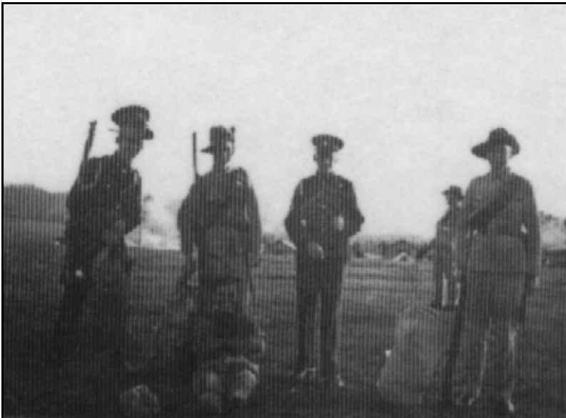
Troops arriving at the 1939 camp.